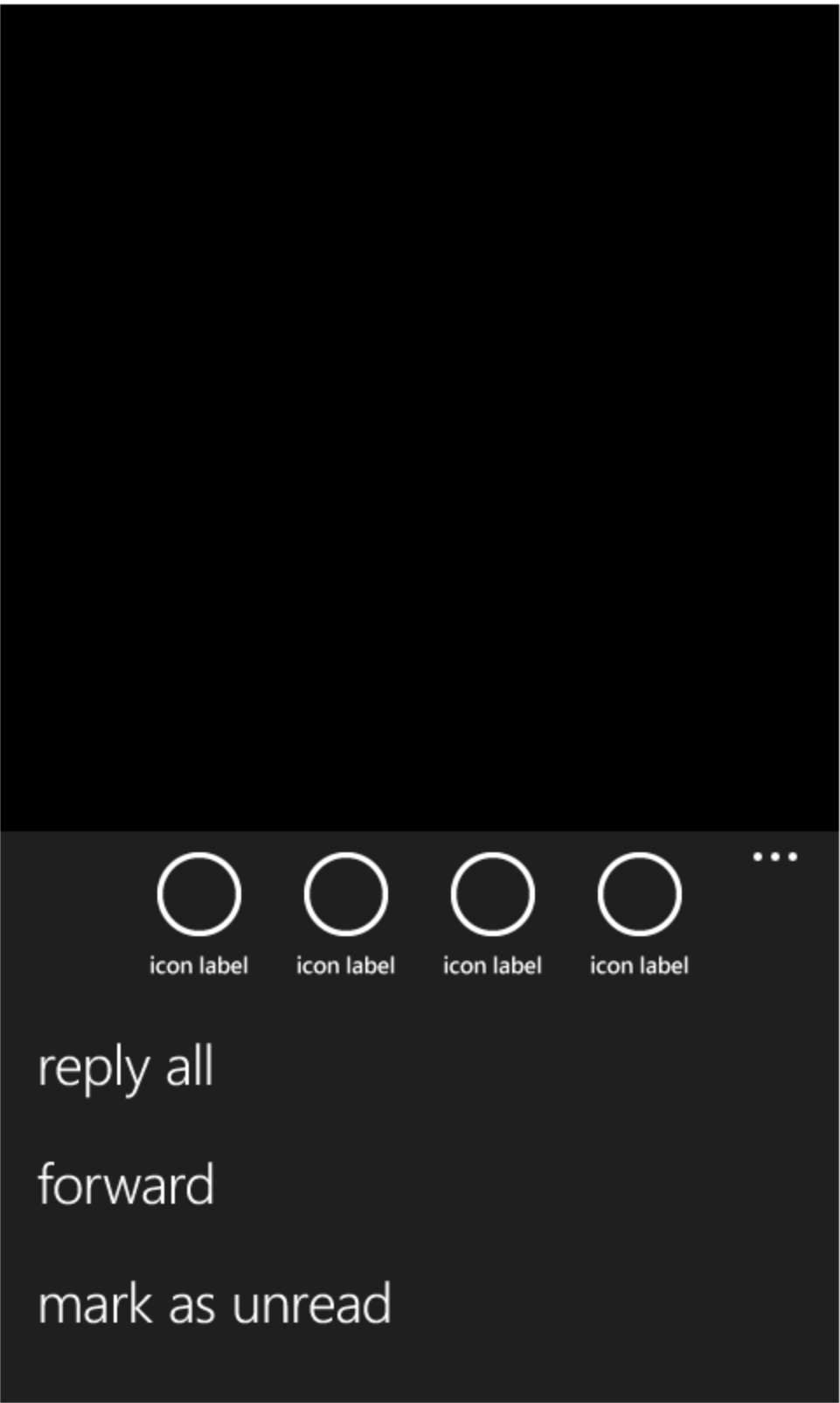
APPLICATION MENU Showing menu sized for 3 overflow tasks