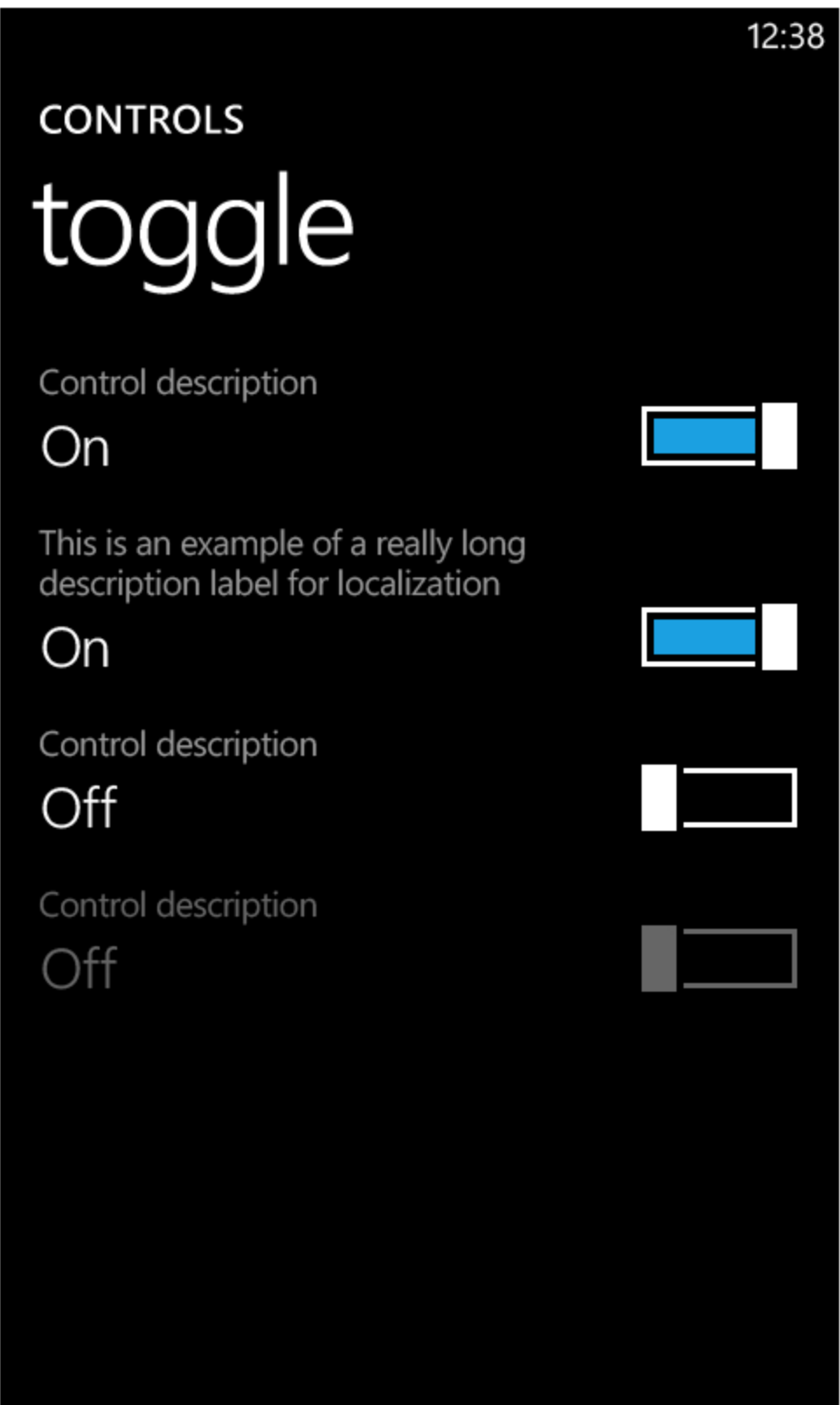
TOGGLE SWITCH Touch interaction states

The toggle switch presents to the user a binary set of mutually exclusive choices, intending to add an element of delight and should be used sparingly. Tapping on the control toggles between the two possible choices. The control shows only one of the two possible choices at any given time, providing visual awareness of the state.