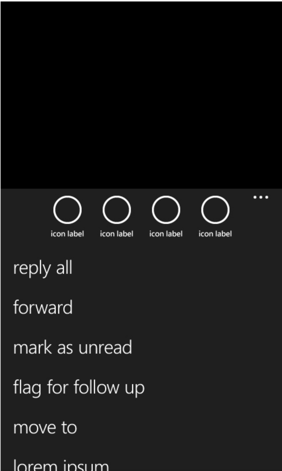
APPLICATION MENU Showing maximum viewable tasks in scrollable region