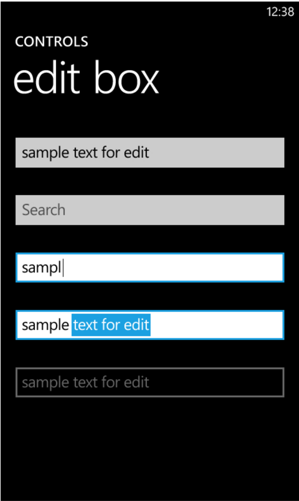
EDIT BOX WITH NO LABELS Touch interaction states